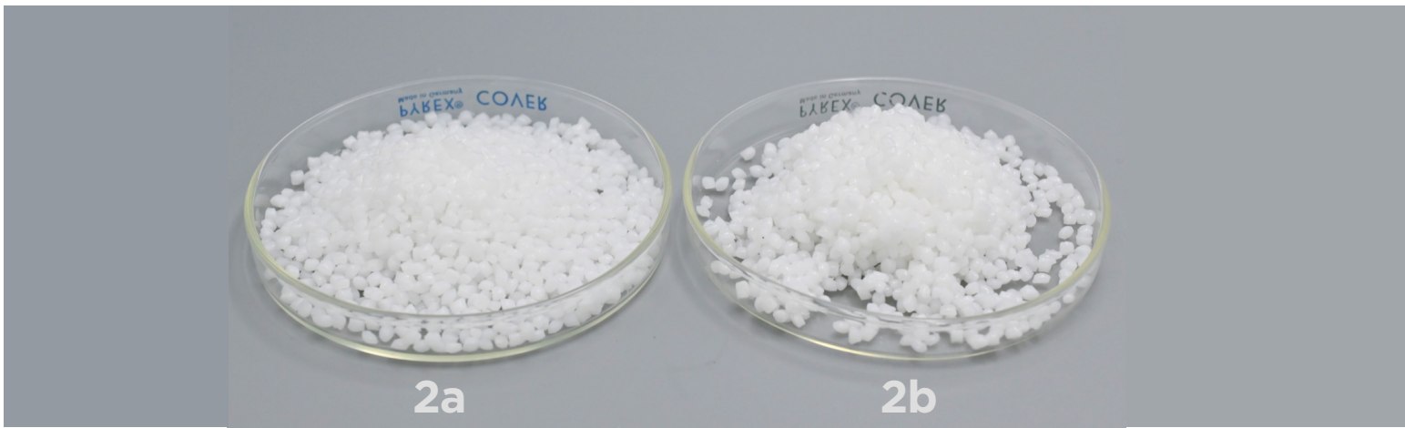
Figure 2a: Ingenia's 10% Liquid AO masterbatch technology: Non-greasy, free-flowing pellets

Figure 2b: Standard 10% masterbatch; pellets with poor flowability and greasy to the touch.